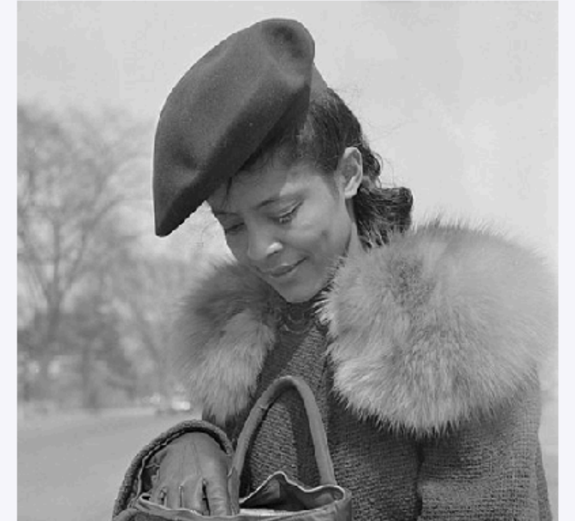
Mazique in 1942