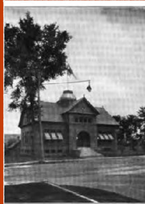
KIMBALL FREE PUBLIC LIBRARY—RANDOLPH.