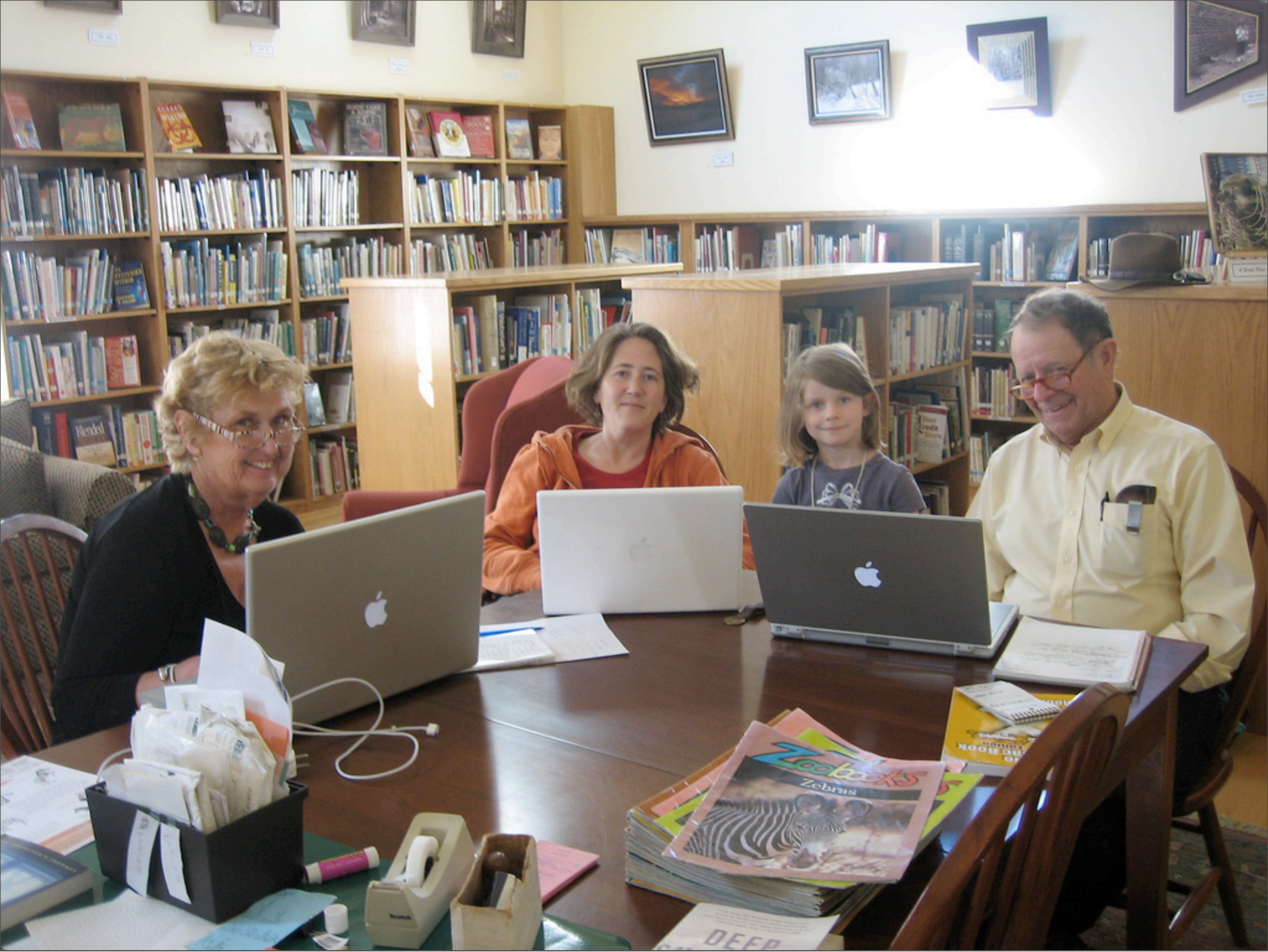
I made a deal with myself...